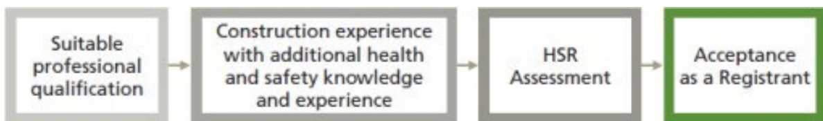
Figure 1 – Direct route to acceptance as a Registrant (HSR)