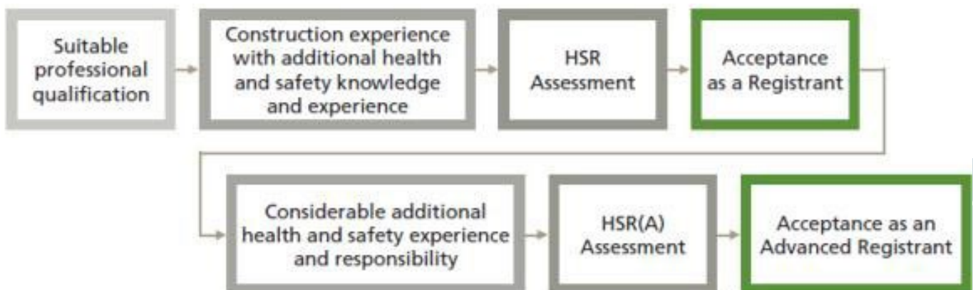
Figure 3 – Progressive route to acceptance as an Advanced Registrant (HSR(A)). No minimum or maximum period of experience is required between the two levels of registration.