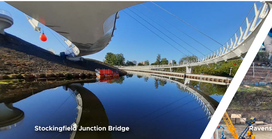
Stockingfield Junction Bridge

Eight projects were named as winners at the Scottish Civil Engineering Awards – widely recognised as the highest honour for engineering excellence in the built environment in Scotland.