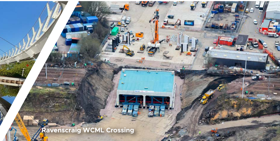
Ravenscraig WCML Crossing

Amongst the winners were the Stockingfield Bridge – which won the 2022 ICE People’s Choice Award – and Union Terrace Gardens, a £28m refurbishment of the sunken Victorian gardens.